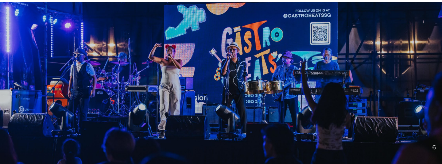
↓ GastroBeats at Bayfront Event Space i Light Singapore (2023)