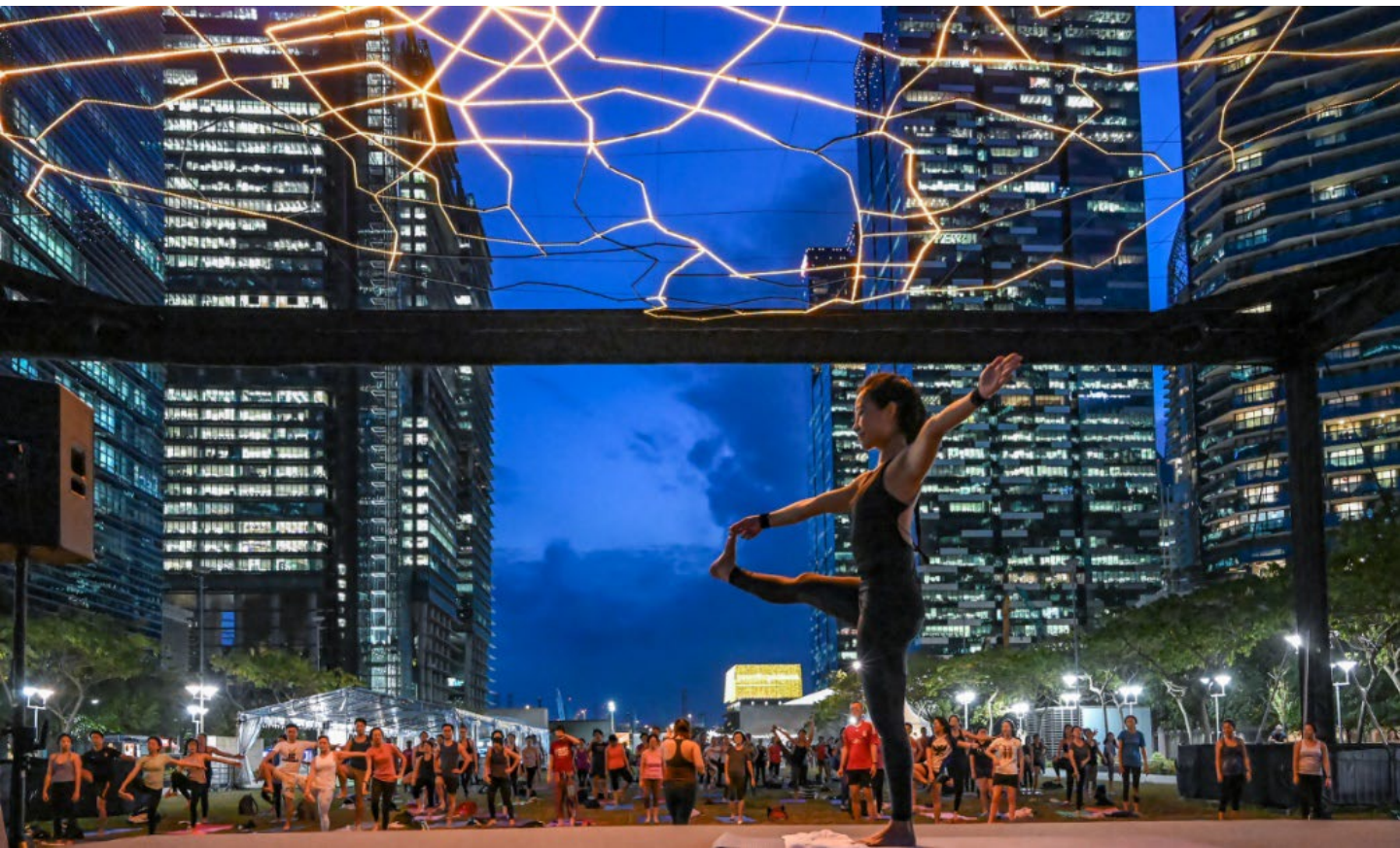
↓ Eco Lawn at The Lawn at Marina Bay i Light Singapore (2019)

[1] The concept of a circular economy hinges on the idea of a closed-loop system, where materials and products are continuously reused or regenerated. It challenges the traditional linear model of 'take, make and dispose', and aims to minimise waste via the consumption of new resources while maximising the use of existing resources.