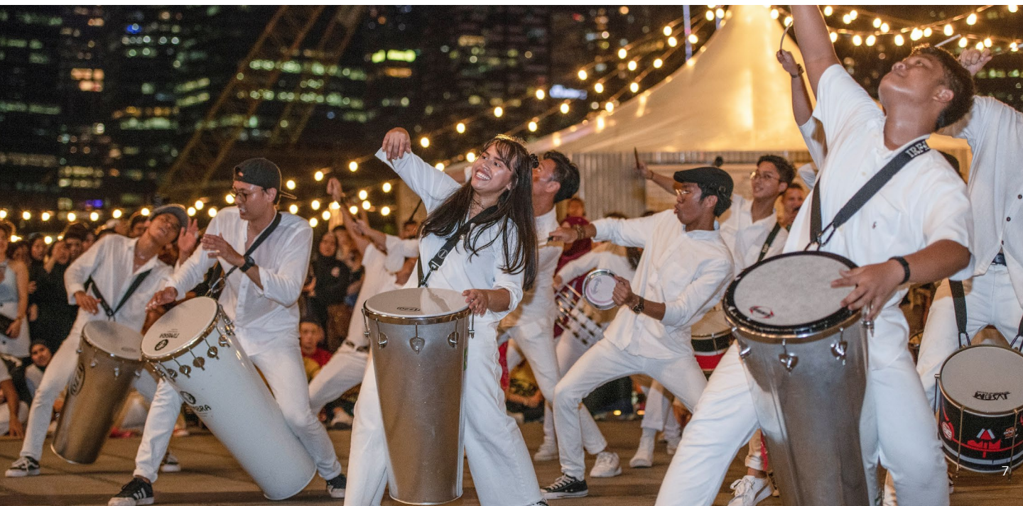
↓ Performance by Beats Encore at Marina Bay Sands Event Plaza i Light Singapore (2019)